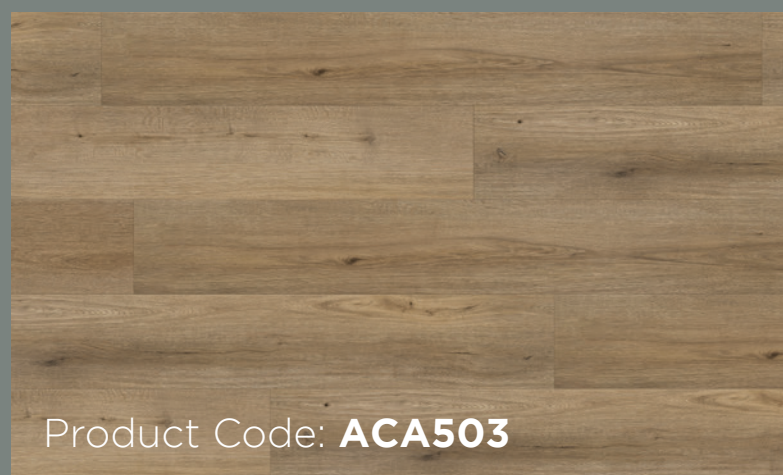
Product Code: ACA503