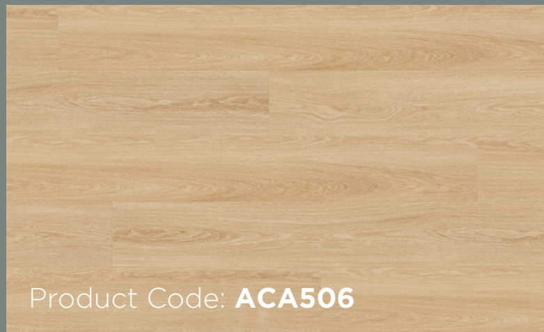
Product Code: ACA506