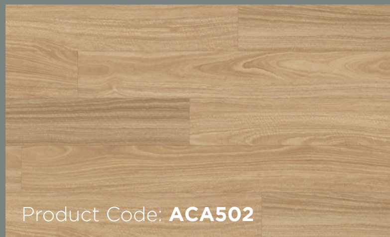
Product Code: ACA502