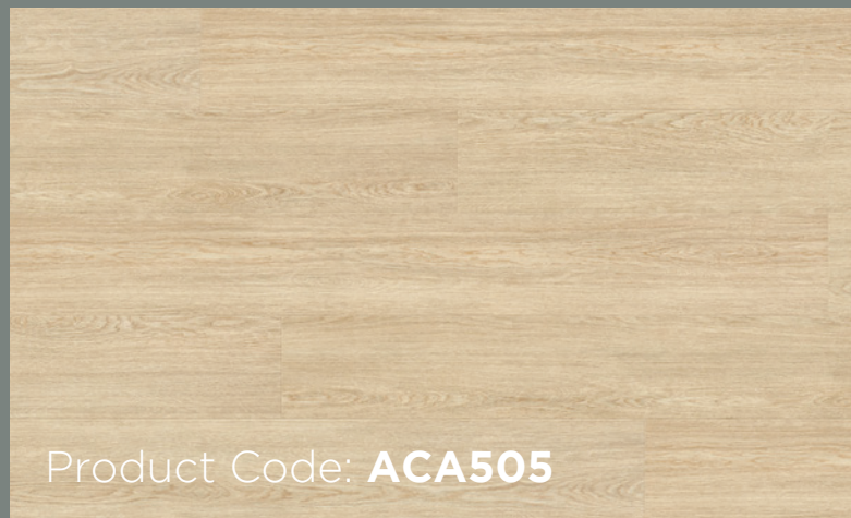
Product Code: ACA505