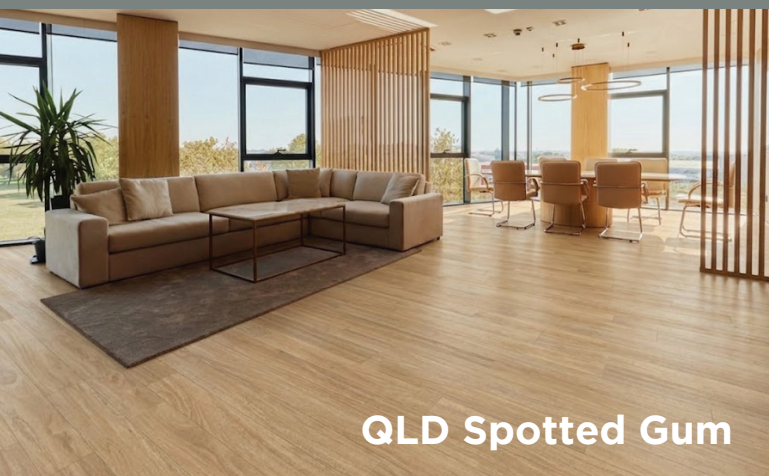
QLD Spotted Gum