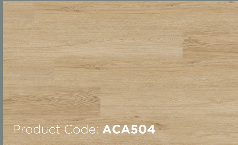
Product Code: ACA504