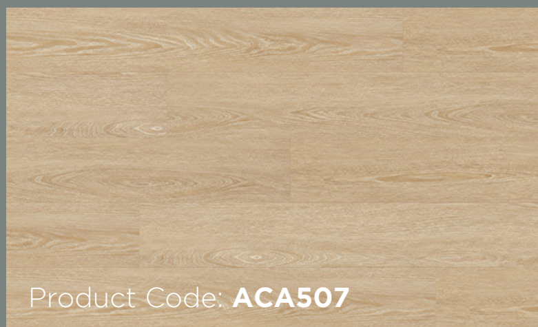
Product Code: ACA507