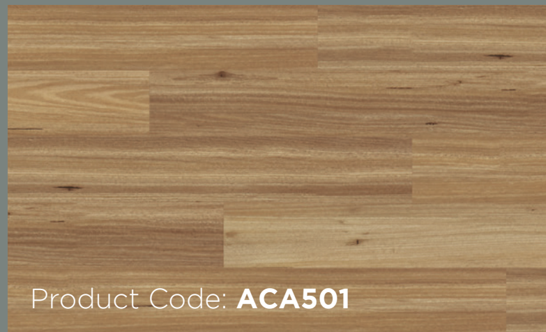
Product Code: ACA501