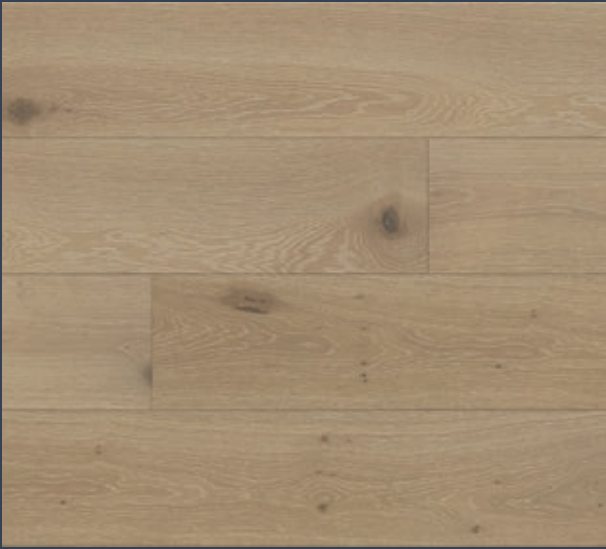
LUX OAK - White Sands