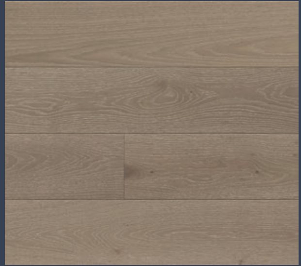
LUX OAK - Wave Grey