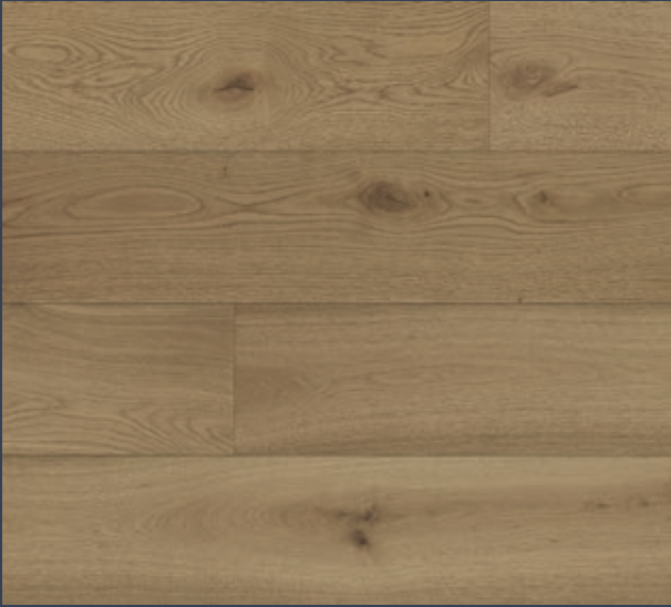
LUX OAK - Latte